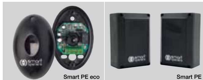
Smart PE eco

The Smart PE Beams provide an additional level of safety to your door via an invisible beam across your driveway. Once this beam is breached, the door will reverse, therefore avoiding or reducing any contact with the object beneath. Not only a Smart decision to install one, but Smart safety for your home.